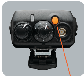
Dedicated Programmable Emergency Button

Industrial and commercial workplace safety programs require emergency preparedness when accidents or hazardous situations arise. This includes a plan to alert help instantly. The Emergency alert function is programmed by your Dealer and is designated to transmit an emergency notice on a specified channel. With a press of a button, the radio transmits an emergency alert to call for help or to notify others to implement the emergency action plan.